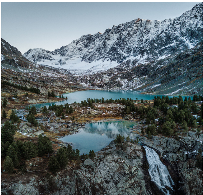
Photo tour to Altai